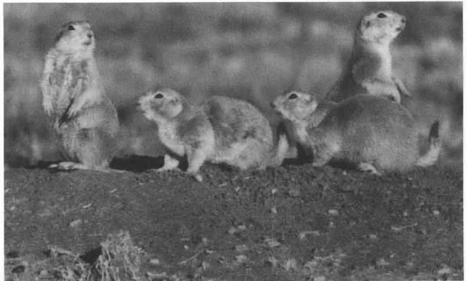
Like bison, prairie dogs are an emblem of the North American prairies—and subject of increasing efforts to reestablish and restore dwindling populations. Shown here are black-tailed prairie dogs the authors and their colleagues reintroduced to a former prairie dog town on the Armendaris Ranch in southern New Mexico. The team found that prairie dogs prefer sites with old burrow complexes, which they quickly reoccupy and restore.

Current interest in the recovery of prairie dogs matches, in intensity if not in general popularity, that of the early ranchers and government agents in eradicating them. Two recent collections of papers (Clark et al., 1989; Oldemeyer et al., 1993), both assembled by agency effort, and a technical book (Hoogland, 1995) at-