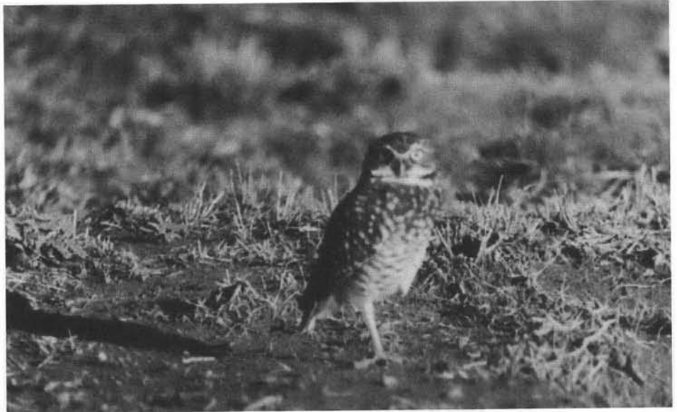
Burrowing owls, long since absent from reintroduction sites, reoccupied them within months after reintroduction of prairie dogs, exemplifying recovery of the ecosystem as a result of reestablishment of this one keystone species. Other effects on the desert grassland ecosystem evident within two years after reintroduction include dramatic changes in vegetation and seasonally selective use of the reintroduction sites by pronghorn antelope, ornate box turtles, and several bird species.

Animals at all three sites on the Armendaris Ranch reproduced during their second spring (1997). Those associated with each of the two pens approximately doubled in number between early spring and early summer. (The population that had reproduced the previous spring had declined during winter to little more than its previous size.) The three adults at the Ishmaelite colony produced at least 14 young, the large increase presumably reflecting in part the influence of the food subsidy we