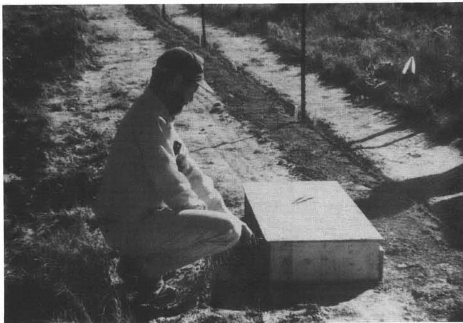
Chicken-wire fencing with buried footing and a 12-volt electric-fencing wire near bottom effectively contained reintroduced populations, slowing dispersal and protecting populations from predation during the first several months of residence. The box is a passively-ventilated cabinet designed to minimize stress on animals during holding and transportation.

On the Armendaris Ranch, we made comparisons of several kinds in conjunction with the releases and subsequent monitoring of the animals. In the pen with augered holes, we compared their acceptance of bored holes with acceptance of old, collapsed prairie-dog burrows. In the same pen, within a few weeks of the initial release, we provided hatches (openings) at the base of the perimeter fence to allow animals to escape. We did not provide escape hatches in the other pen. We fed animals in one pen throughout the first year; those in the other pen we fed only during the first few months. Four animals that escaped through the hatches soon formed a